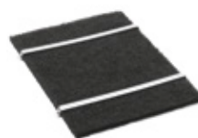
Set of no. 1 carbon filters KITCF003 Code EAN 8019801015061