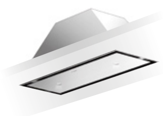
Stainless steel CHB 9012 X Code EAN 8019801013388