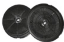
Set of 2 charcoal filters KITCF009 Code EAN 8019801015863