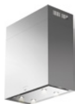
Stainless steel FCHI 900 X Code EAN 8019801015771