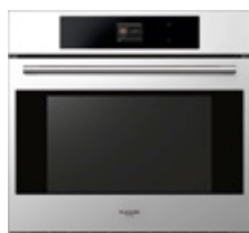
Fingerprint resistant stainless steel FCO 300 P TM 2F X Code EAN 8019801017300