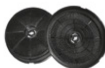
Set of 2 charcoal filters KITCF009 Code EAN 8019801015863