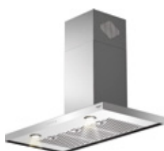
Stainless steel FQH 1200 X Code EAN 8019801015733