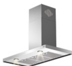
Stainless steel FQH 900 X Code EAN 8019801015726