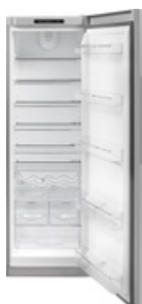
Stainless steel door FRSI 400 F ED X Code EAN 8019801014613