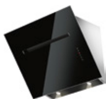
Obsidian black glass FLH 800 TC BK Code EAN 8019801015702