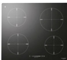
CeraBlack glass ceramic CH 604 ID TS BK Code EAN 8019801014415