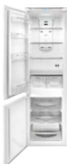
Sliding system FBC 342 TNF ED Code EAN 8019801014637