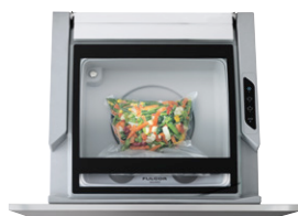
FVSD 2900 TC