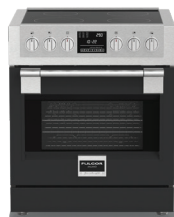
MATTE BLACK STEEL FSRC 3004 P MI ED 2F MBK