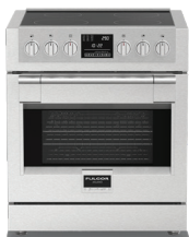
STAINLESS STEEL FSRC 3004 P MI ED 2F X