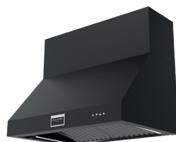
MATTE BLACK STEEL FPRHD 362 TC MBK