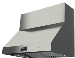
STAINLESS STEEL FPRHD 362 TC X

Chimney extension KIT: FPRHD 362 Set of 2 HP filters for filtering version: FHCF 23